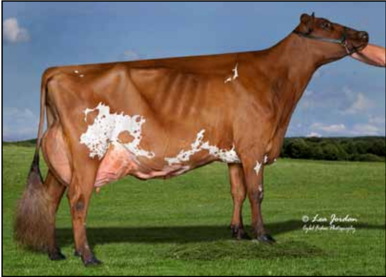
Photo: Dam, Cedarcut Burdette Clove Colata, EX-94 2E