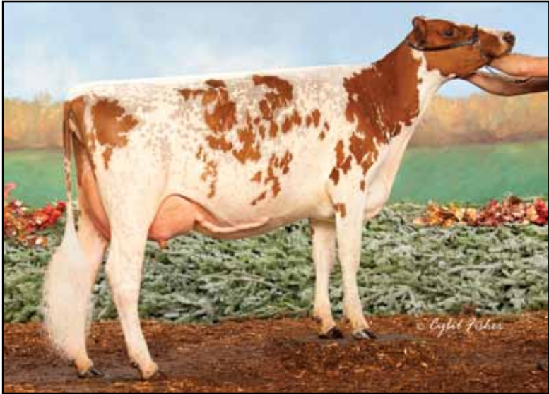
Photo: Daughter, Palmyra Reagan DT Rosy, VG-87