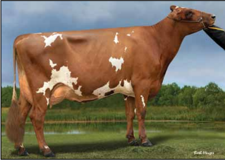
Photo: Dam, Palmyra Alaska B Ruth, EX-90