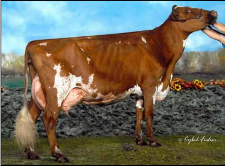
Photo: Granddam, Hi-Ayr-View Masterpiece Juju, EX-90