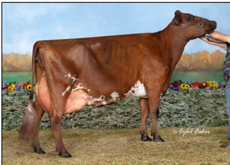
Photo: Dam, Daltondale BBK Kuddles, EX-92 4E