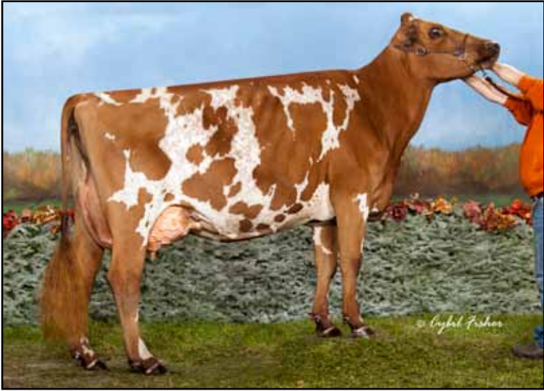
Photo: Dam, Grand-View Calimero Dea-ET, EX-91 2E